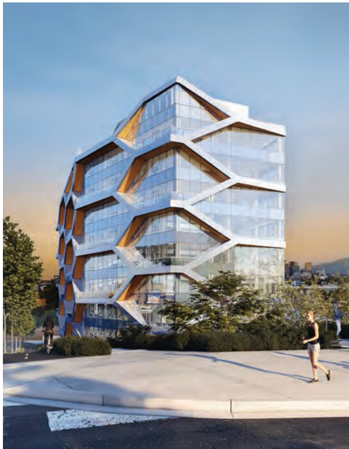
Rendering courtesy of DIALOG

Artist rendering | The balconies are connected by a diagonal strut visually aligned with the timber braced frames, creating a self-supported balcony structure that does not rely on cantilevers from the primary building structure. This allows the balcony elements to be pinned back to the primary structure, therefore reducing thermal breaks through the building envelope.