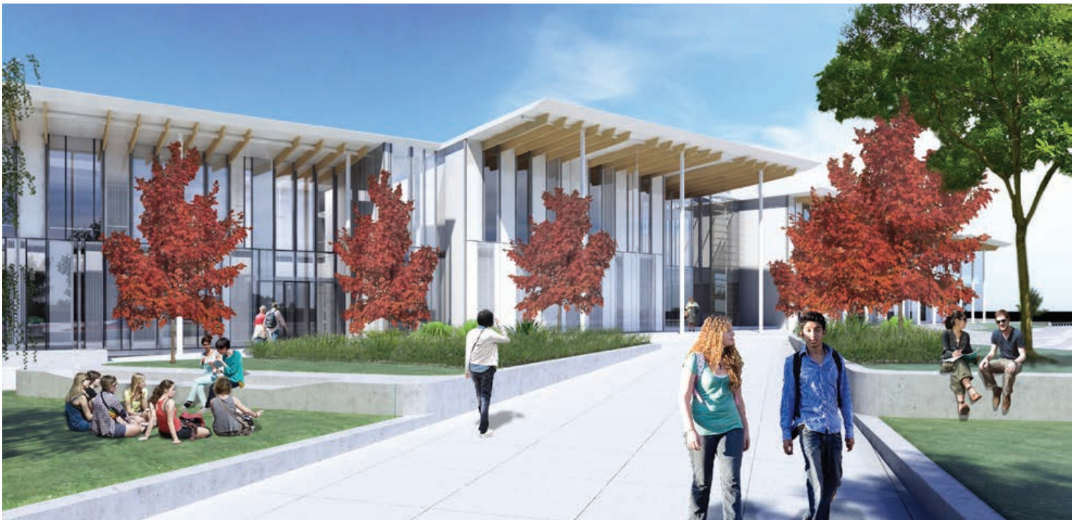
Rendering courtesy of HCMA Architecture + Design

The use of wood also provided structural benefits. Richmond has a high water table that results in soil instability, so wood's light weight reduced the overall weight of the structure, which simplified the foundation requirements. Glulam beams will provide durable performance in the aquatics space, and since pools tend to be noisy, wood's natural acoustical properties were also an advantage.