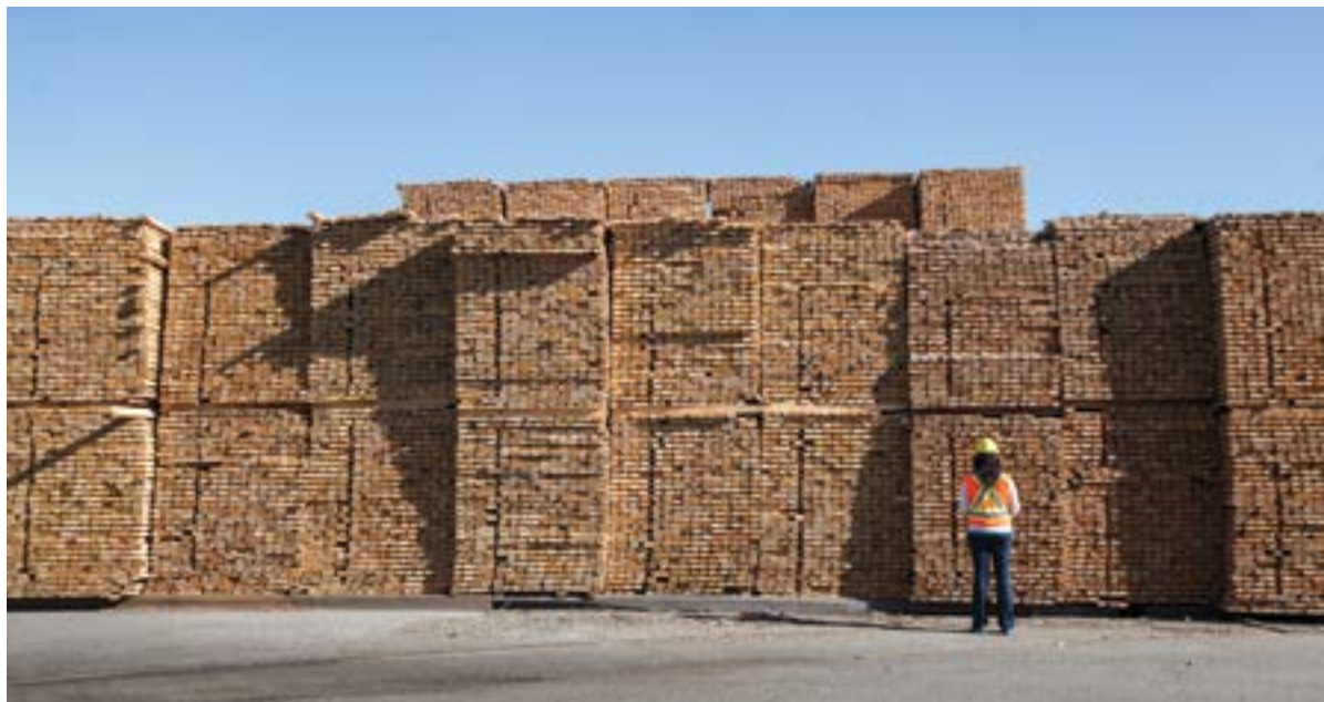
British Columbia is a reliable supplier of forest products from legal and sustainable sources.

Penalties for offences such as unauthorized harvesting, damaging the environment or failure to properly reforest a harvest site, can include fines from $5,000 to $1 million and imprisonment from six months to three years.