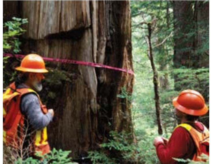
Companies and forest professionals in B.C. are held accountable for their practices through strict forest management planning and approval processes.

B.C.’s comprehensive regulatory and enforcement regime ensures the risk of illegal logging in B.C. is negligible. 1,5