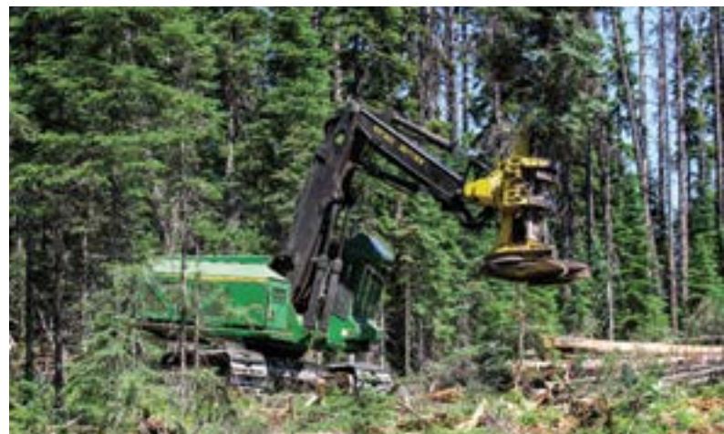
All timber harvesting operations on public lands must comply with the results-based Forests and Range Practices Act.