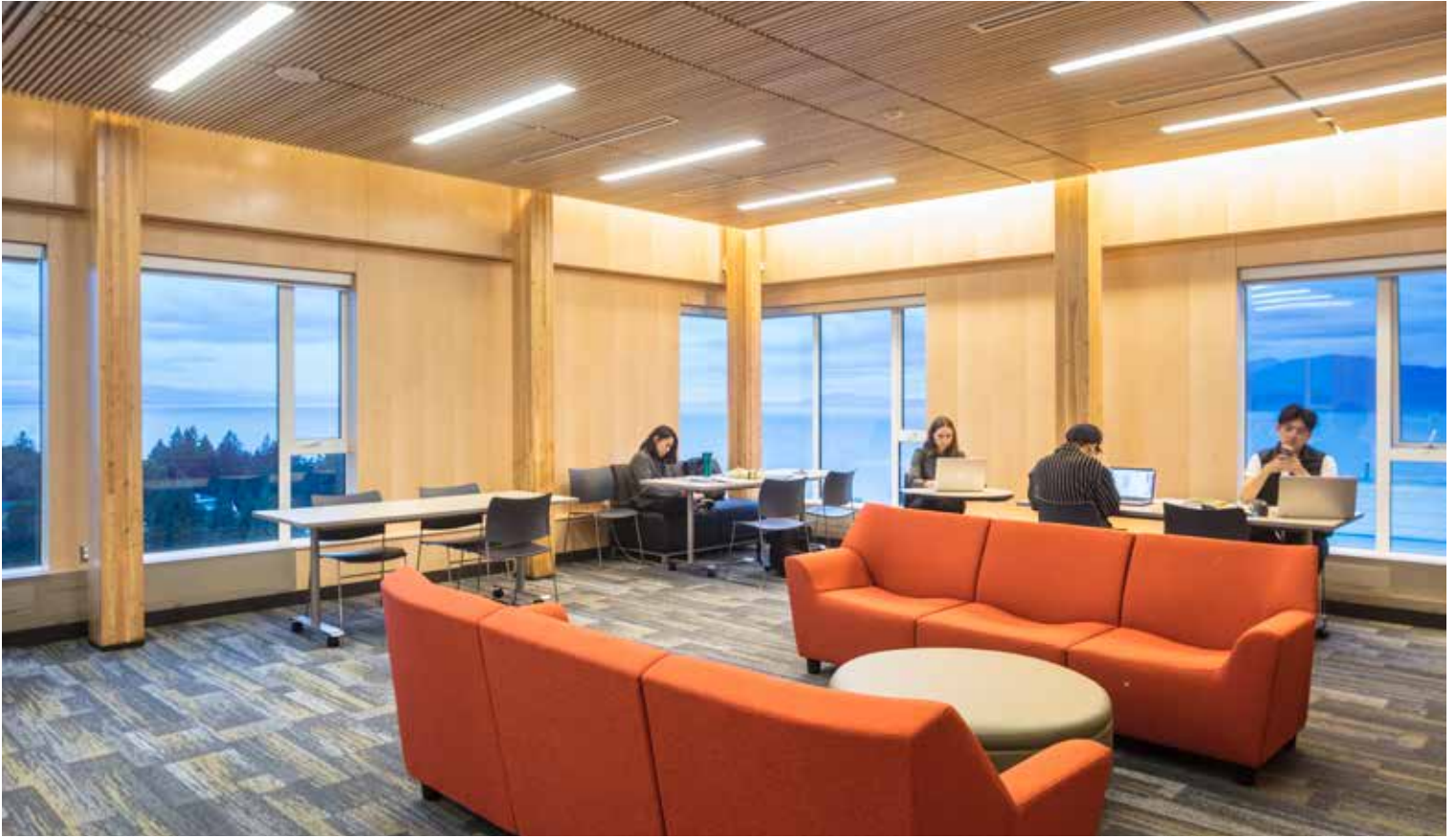
Student study space on 18th-storey of Brock Commons Tallwood House | Architect: Acton Ostry Architects Inc.