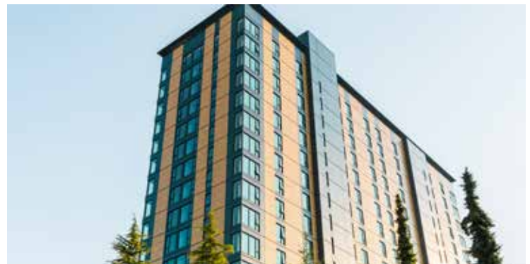
Brock Commons Tallwood House | Architect: Acton Ostry Architects Inc.

Brock Commons Tallwood House, a mass timber hybrid structure, and Ponderosa Commons Cedar House, a reinforced concrete building are two student residences at the University of British Columbia. Both completed in 2017, Ponderosa Commons, sits at 17 storeys and 12,838 square metres and Brock Commons is an 18 storey, 15,115 square metre structure which features CLT, PSL and glulam.