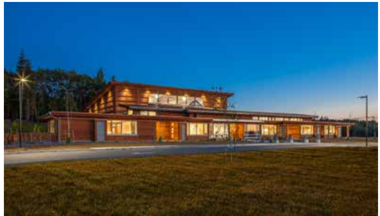
Kwakiutl Wagalus School

The use of wood in buildings, and as part of daily life, is an integral part of the heritage and culture of the Kwakiutl First Nation. The 1,648 square metre Port Hardy school, completed in 2016, features western red cedar from local forests in every aspect of the building's design. Special effort was made to highlight the use of wood as a prominent structural element as well as for interior and exterior finishes. Douglas-fir and spruce-pine-fir are also featured in the building. The school's gymnasium was designed as a system of prefabricated tilt-up wood panels to speed up construction. It took just 19 days to erect the gym walls and nine days to add the roof, allowing the gym to be enclosed quickly and avoid exposure to rain during construction.