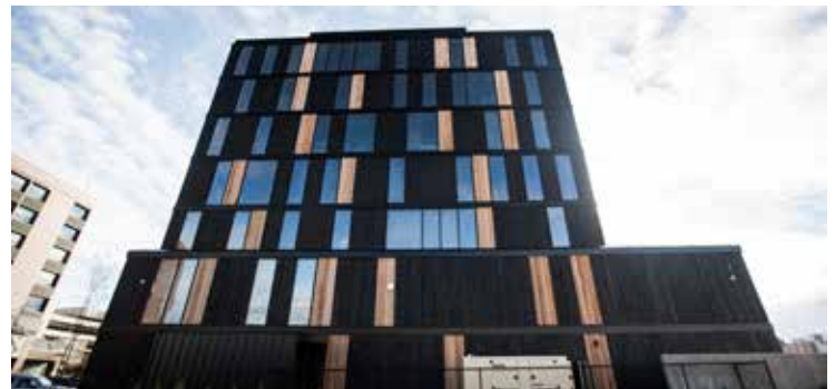
Wood Innovation and Design Centre | Architect: MGA | Michael Green Architecture

Completed in October 2014, the Wood Innovation and Design Centre is six storeys and 4,820 square metres. The Prince George office building utilized dimensional lumber, plywood panels and western red cedar siding as well as glue-laminated timber (glulam), cross-laminated timber (CLT), parallel strand lumber (PSL), and laminated veneer lumber (LVL), all of which were produced in British Columbia. The simplicity of the building — a clean, modern box — lends itself to being a repeatable and expandable template for future tall wood office buildings.