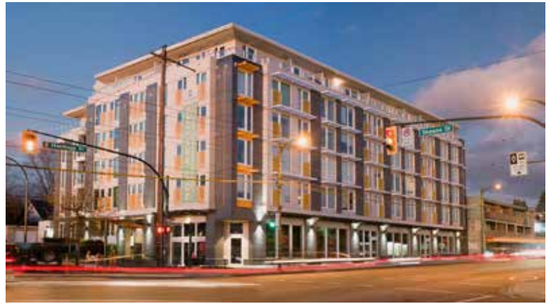
The Heights

The Heights saw improvements in all six impact categories when compared to the baseline design and would earn four LEED points. This was achieved by using engineered and solid wood floor and roof systems instead of reinforced concrete.