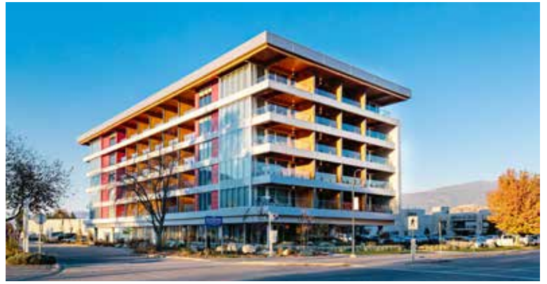
Lakeside Resort expansion | Architect: HDR | CEI | Photo: Jon Adrian

The Lakeside Resort expansion in Penticton, is a 70-unit, 5,150 square metre hotel constructed of mass timber. Speed of construction, reduced building weight and desire for a more attractive facility convinced the Lakeside Resort owner to use wood instead of concrete when they expanded their resort in 2016. The structure was framed by Douglas-fir glulam beams and columns, left exposed to the interior. Glulam was also used to build a dramatic 30-foot high wall using a double lattice of beams to frame the windows. CLT panels were used for all major shear elements of the building and to frame the stairwells and stairs.