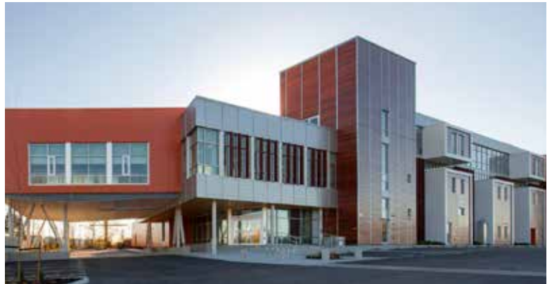
Pacific Autism Family Centre | Architect: NSDA Architects

The three-storey, 5,751-square-metre structure in Richmond was designed to present a calming environment, including oversized waiting areas to prevent feelings of claustrophobia or confinement. Wood reinforced the welcoming atmosphere, and offered a cost-effective structural solution with long spans that could accommodate future reconfiguration should the needs of autism research and treatment change.