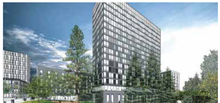
Ponderosa Commons Cedar House | Rendering courtesy of KPMB Architects, HCMA & UBC

The sensitivity analysis showed that utilizing more mass timber, resulted in reduction of negative impacts in most categories and increase in positive impacts in most categories.