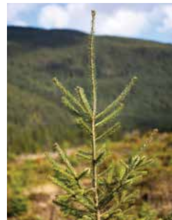
B.C. plants seedlings in areas best suited to the species in anticipation of a changing climate.

Indufor Group ( www.indufor.fi ) is one of the world's leading forest consulting service providers. It helps both public and private sector organizations add value when they are reshaping and defining their strategies, forest policies and governance issues at the international, national and local level. Its work related to forest certification has included global data on certified forests, conformity analyses on certification systems against international requirements, and training and capacity building.