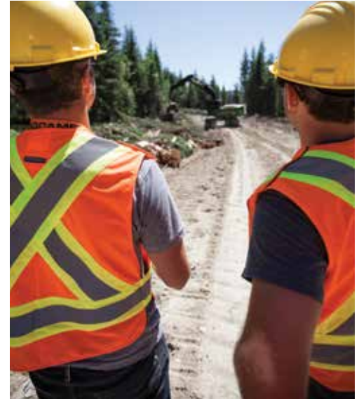
Companies and forest professionals in B.C. are held accountable for their practices.