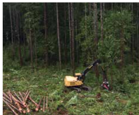
Harvesting a cutblock.

British Columbia does not allow industrial plantations with exotic species or have any area that meets the Food and Agriculture Organization definition of plantation 3 so this is not addressed in forest legislation.