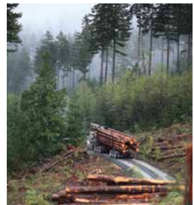
To prevent illegal logging, legislation requires timber to be marked before transport.

Trained officials monitor forest activities to prevent illegal logging, and wood must be conspicuously marked before it is removed from the harvest site. Legislation sets mandatory provisions that prohibit illegal logging. The certification standards add a requirement to monitor legal compliance through a management system (CSA).