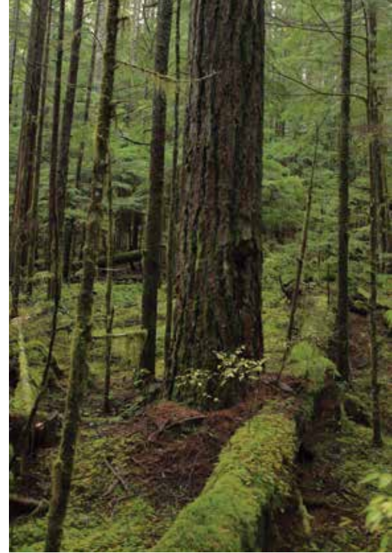
B.C.'s Forest and Range Practices Act governs the activities of forest and range licensees and legislates on-the-ground results.