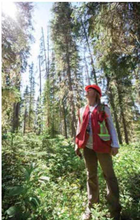
B.C. ensures public lands provide a mix of benefits such as timber, recreational opportunities, water quality, and wildlife habitat.