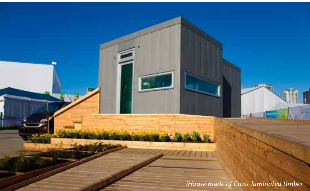
iHouse made of Cross-laminated timber

As lumber demand increases and prices increase, forest companies may move operations to areas that were previously uneconomic to harvest.