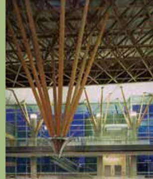
Central City, Surrey, British Columbia Bing Thom Architects

Architect Bing Thom said he chose wood for key structural components in the retail and commercial development at Surrey Central City, BC "to provide a warm and tactile contrast to the smooth synthetic environment of the modern high-tech work space."