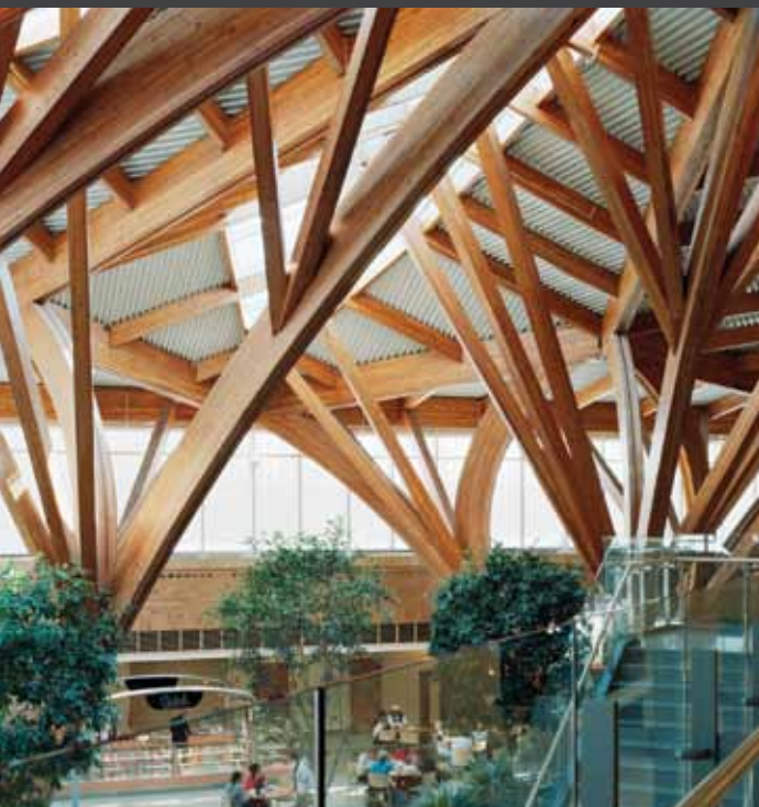
Carlo Fidani Peel Regional Cancer Centre, Mississauga, Ontario Farrow Partnership Architects Inc.