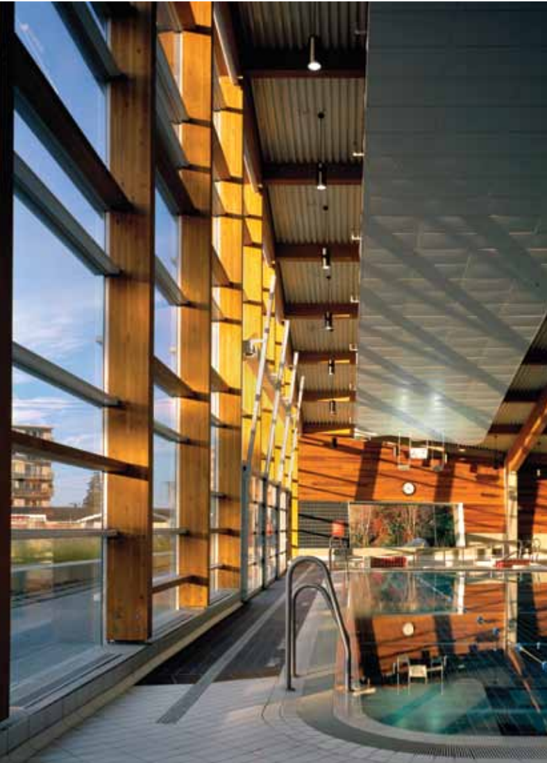
Left Image: West Vancouver Aquatic Centre, British Columbia Hughes Condon Marler: Architects